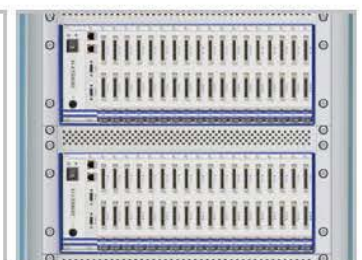
19" mounting kit available