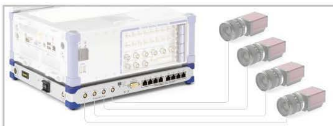
Box for connecting up to 4 GigE cameras, with integrated power supply [CAM-GIGE-SPLIT-01-BOX]