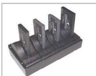
Desktop battery charger for 4 batteries [BAT-CHARGER-4]